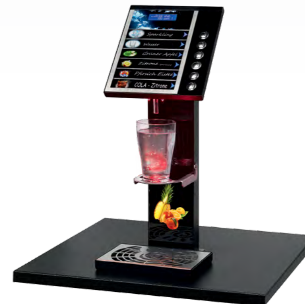
Model JDM CT-L DESIGN Frontdisplay by request with customer-specific logo or design of drink brand, mit LED-lighting (not for CO 2 -Option)