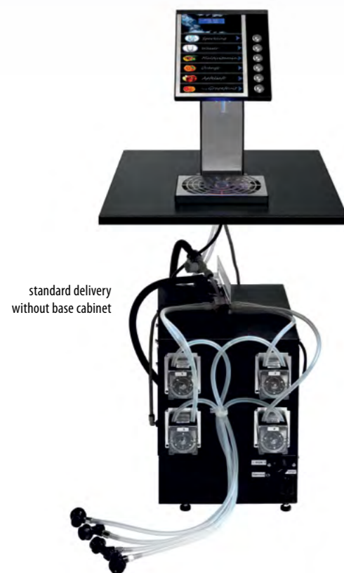
standard delivery without base cabinet

No annoying boxes on your counter and up to 6 drinks (also hot&cold) plus water plus CO 2 (Option)! Attractively styled, smart and timeless, with vandal-proof stainless steel selection buttons and integrated customer info display. The placement of the cup is highlighted with LED lighting.