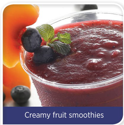
Creamy fruit smoothies