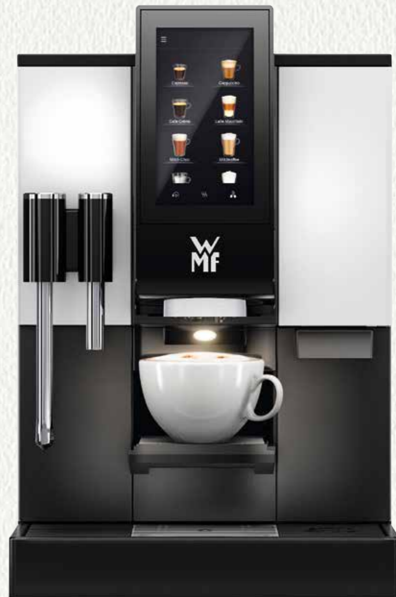
WMF 1100 S with Basic Steam