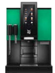
Gloss Kelly Green