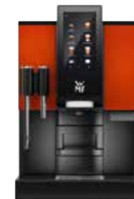
Gloss Hotrod Red