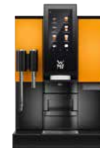
Gloss Burnt Orange